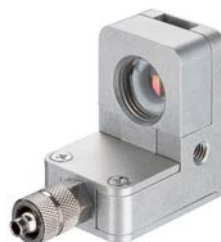
TM-APLCF-CS Air purge collar, laminar with integrated ancillary CF lens