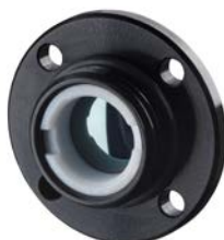
TM-CF-CX Ancillary CF lens, TM-PW-CX Protective window