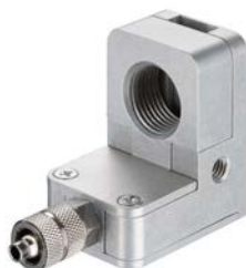
TM-APL-CS Air purge collar, laminar